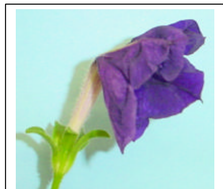
Figure 1: flower senescence

Decreased plant quality and sale ability following production are generally the result of plant senescence. Senescence represents the last stage of plant development and often results in the death of whole plants or plant organs including leaves or flowers. While senescence is a natural part of plant development, environmental stresses during shipping, in retail environments, and in the home and garden can accelerate senescence. These stresses include less than optimal watering and exposure to high temperatures and ethylene gas. Symptoms of senescence that reduce the quality of floriculture crops include leaf yellowing, flower wilting, abscission of flowers and flower parts, fading of blossoms, and death.